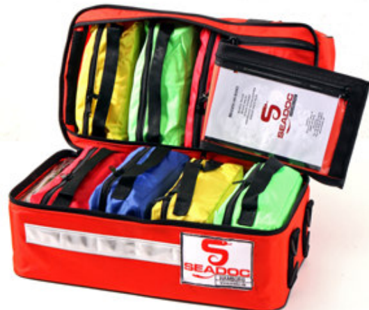
Equipment Sailing II and III Bag Ocean