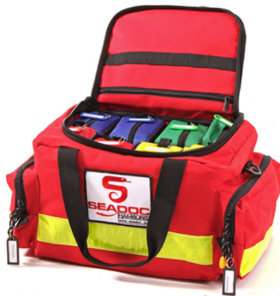
Equipment Sailing I Bag Baltic

⇒ Sailing II and III : the First Aid -kit is stored separately - easily available in First-Aid situations, also can be taken along on land-excursions