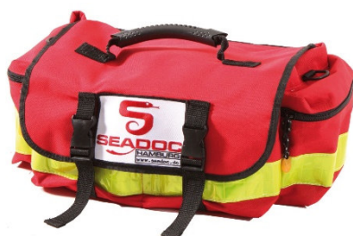
Equipment First Aid I and II - Bag Coast -