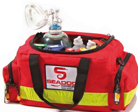
Equipment Resuscitation Professional Bag Baltic

⇒ Equipments for First Responder und Medics including oxygen, AED, ... see seadoc.de - Equipments – Resuscitation Professional