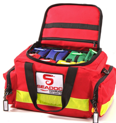
Equipment First Aid II including accessory pack - Bag Baltic -